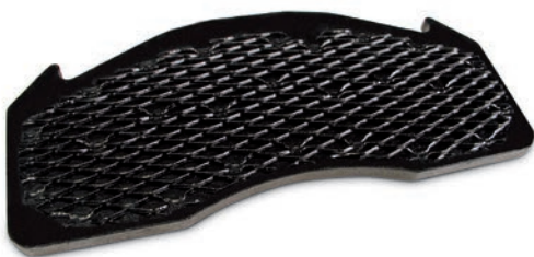
Steel plate with weld mesh