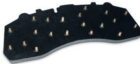
Backing plate with brass pins