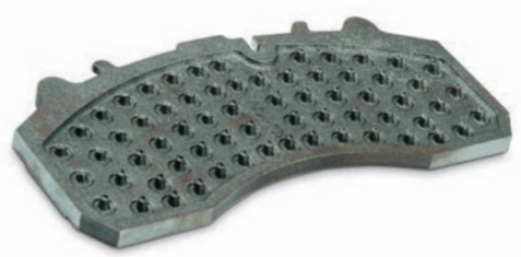
Cast iron backing plate